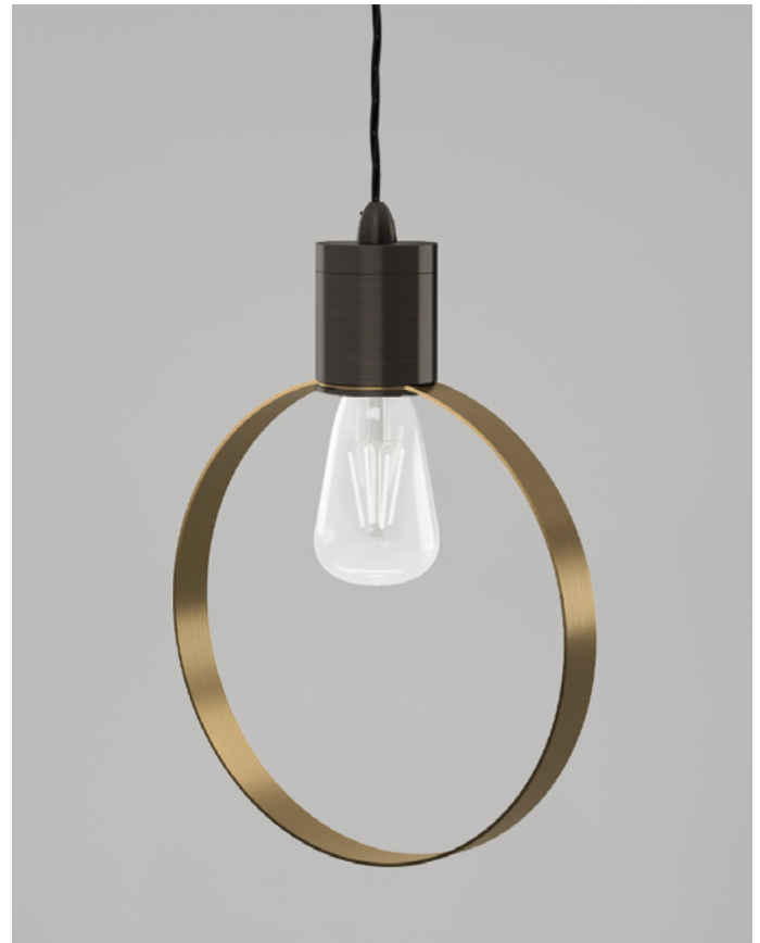
Iron i02.25.IRN + A35.RNG.OB