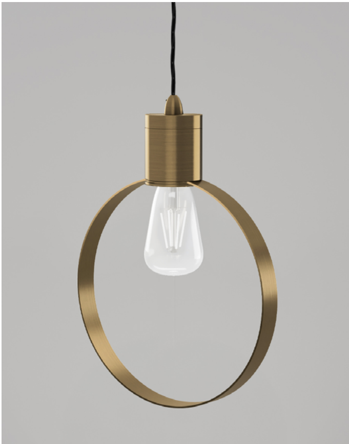
Old Brass i02.25.OB + A35.RNG.OB