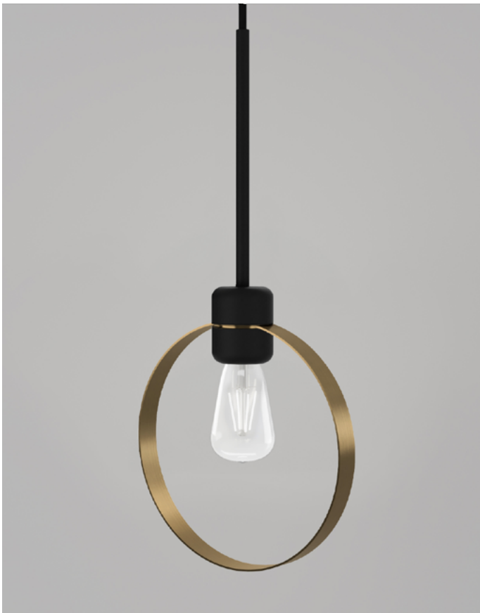
Textured Black i02.26.BL + A35.RNG.OB