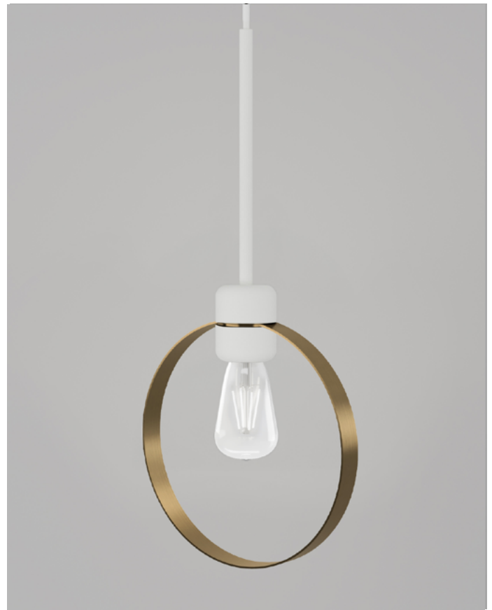
Textured White i02.26.WH + A35.RNG.OB