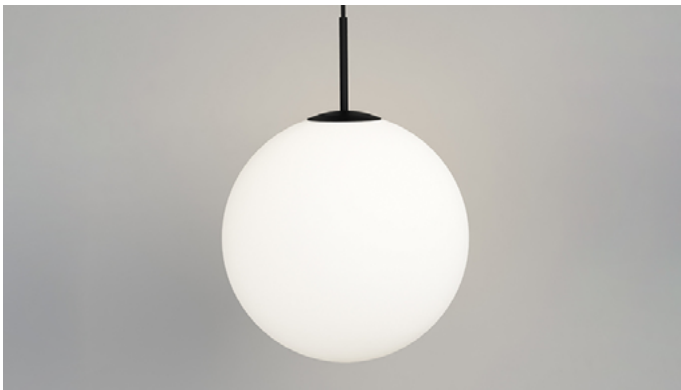
Extra Large | Textured Black i02.55.XL.BL