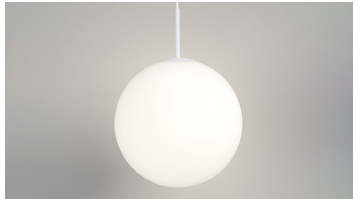
Extra Large | Textured White i02.55.XL.WH