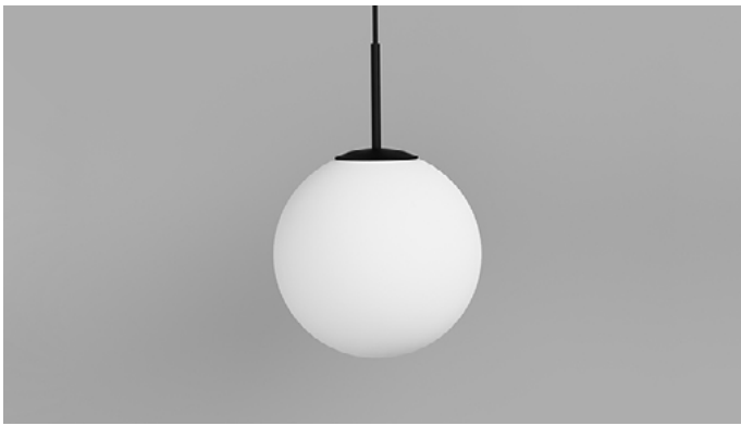
Large | Textured Black i02.55.L.BL