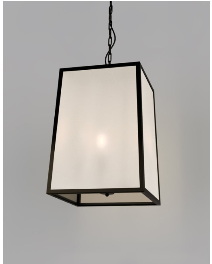
4 Light | Frosted i03.73.003.FR