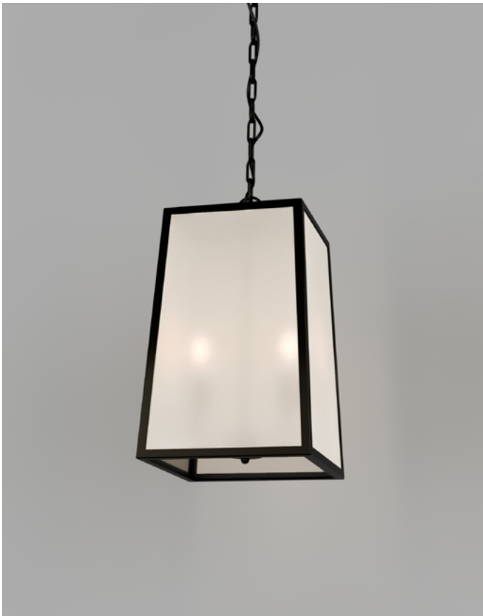
2 Light | Frosted i03.73.002.FR